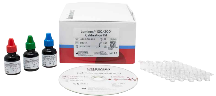
Luminex® 200™ Calibration Kit